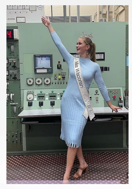
Miss America 2023 is a nuclear engineer

Nuclear Engineers – reactor core design, safety analysis, monitoring the reactor core, reactor materials, fuel performance, fuel contracts/economics, project management, reactor engineering (Operations), licensing, nuclear software, radiation protection, etc.