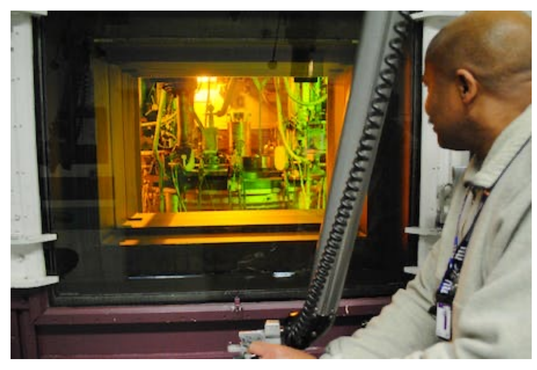
FCF Operations