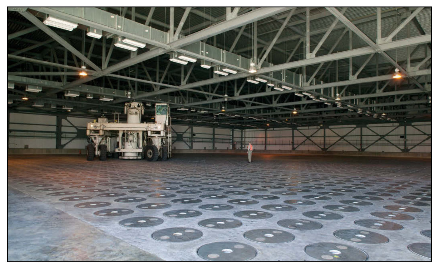
Glass Waste Storage Building 1 at SRS is the interim storage facility for vitrified waste after being treated at the DWPF. The vehicle, called the shielded canister transporter, transports canisters one-by-one from DWPF to the Glass Waste Storage Buildings.

SRR is working with the customer (the DOE) and state regulators to ensure that every nuance of the work receives the right vetting, explanation, and understanding.