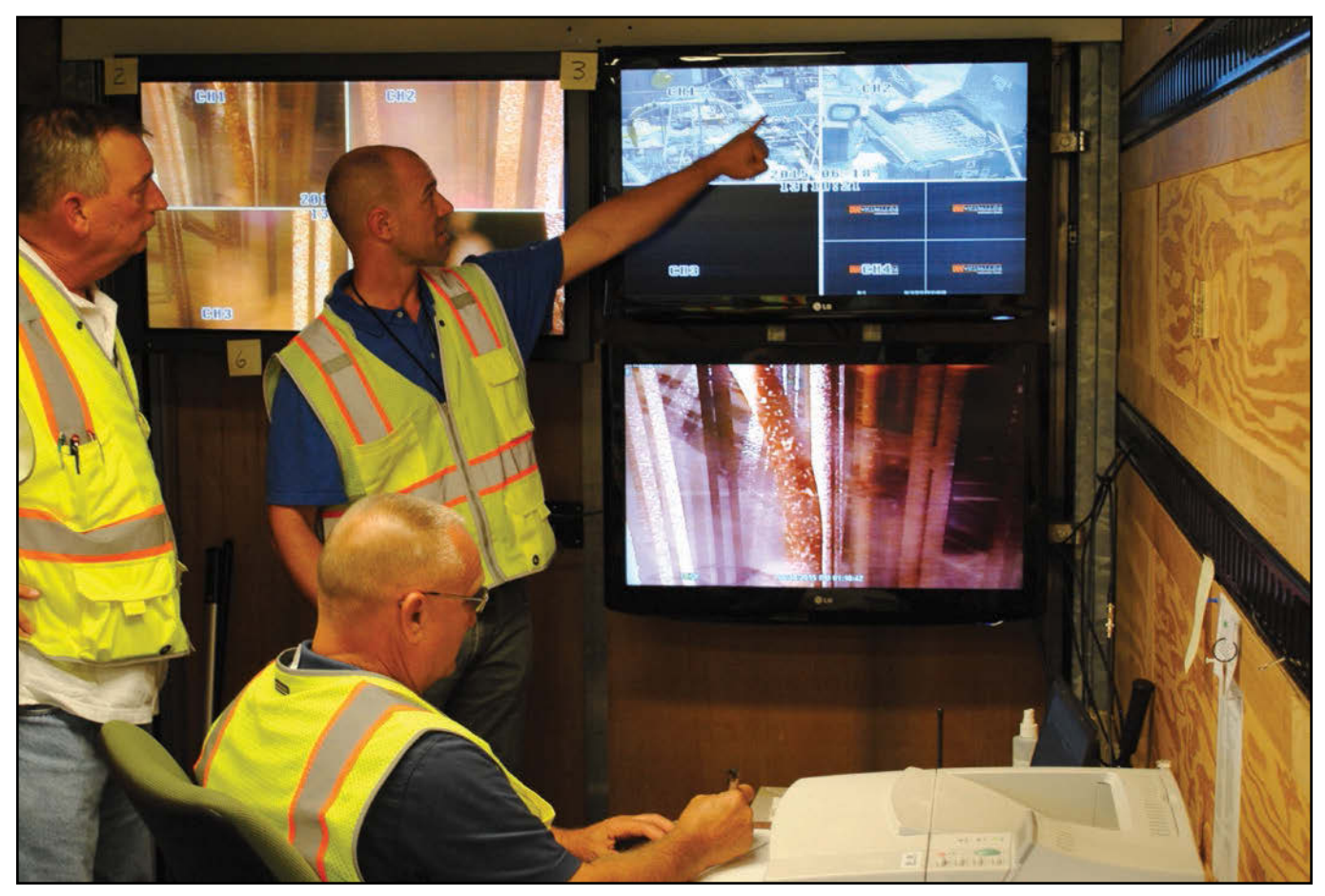
Employees of SRR, the liquid waste contractor at the DOE's Savannah River Site, monitor the grout-pour control room for the grouting of Tank 16, a radioactive liquid waste tank.