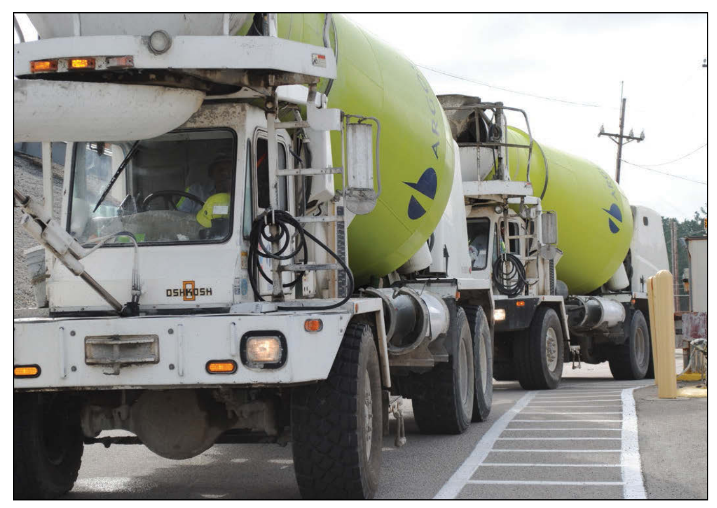
Cement trucks line up on June 2, 2015, to begin filling Tank 16 with specially formulated grout.

tank was ever closed. The history of SRS is the foundation of this mission. Beginning more than 60 years ago, the Savannah River Site set the stage for environmental cleanup of Cold War-era waste.