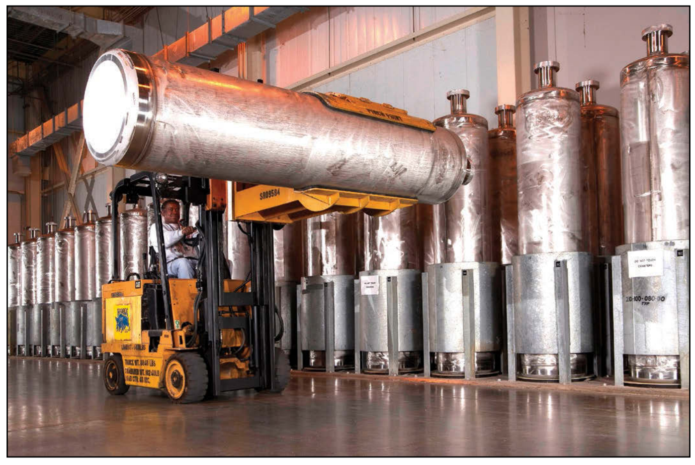
High-activity liquid waste from the waste tanks at SRS goes to the DWPF, where it is vitrified, then stored in these 10-foot-tall stainless steel canisters. A forklift operator transports an empty canister.

and has the higher levels of radioactivity.