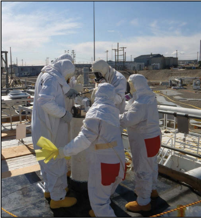
The DOE did not consider alternatives to treating tank waste at the Hanford Site in Washington, a federal audit found. For more, turn to Headlines, page 12.