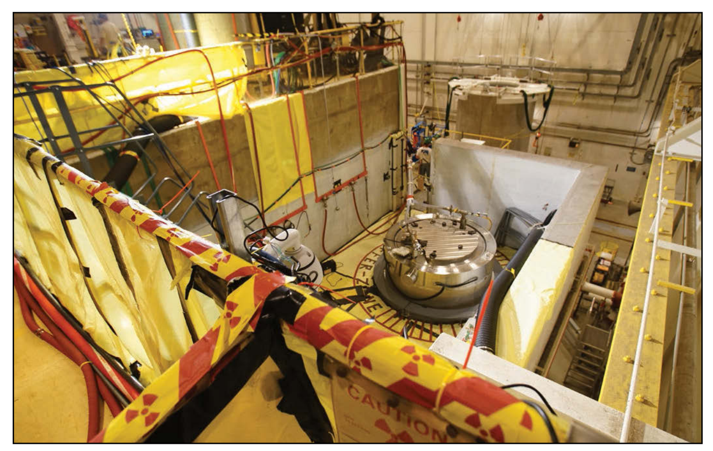
After being loaded and welded shut, a spent fuel canister undergoes drying before being placed in a Magnastor concrete cask, which can be seen in the background.