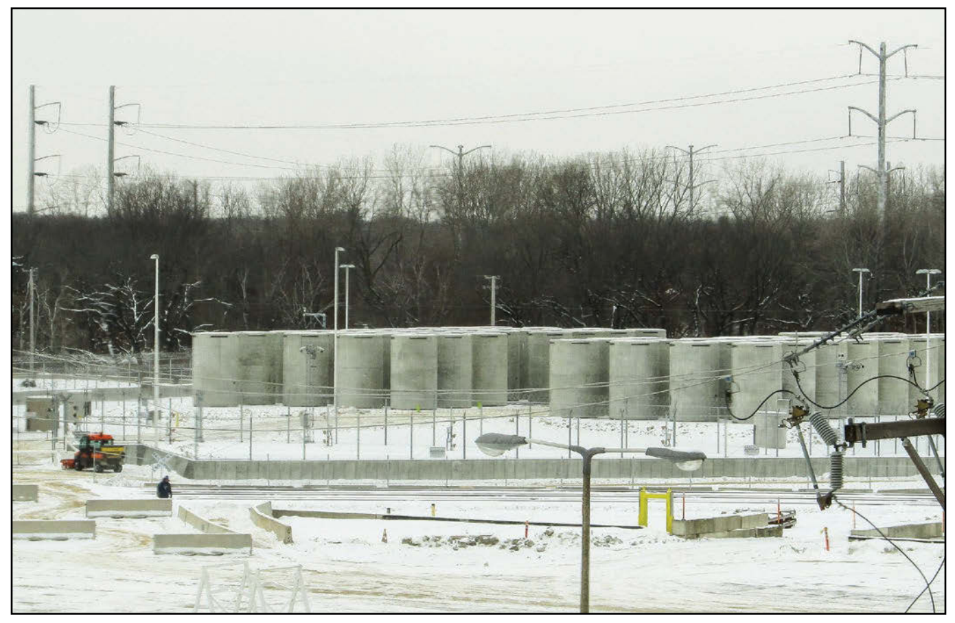
The full Zion ISFSI contains 61 Magnastor spent fuel casks and four greater-than-Class C waste casks. Other than a switchyard, the ISFSI will be the only remaining structure on the site once decommissioning is completed in 2020.