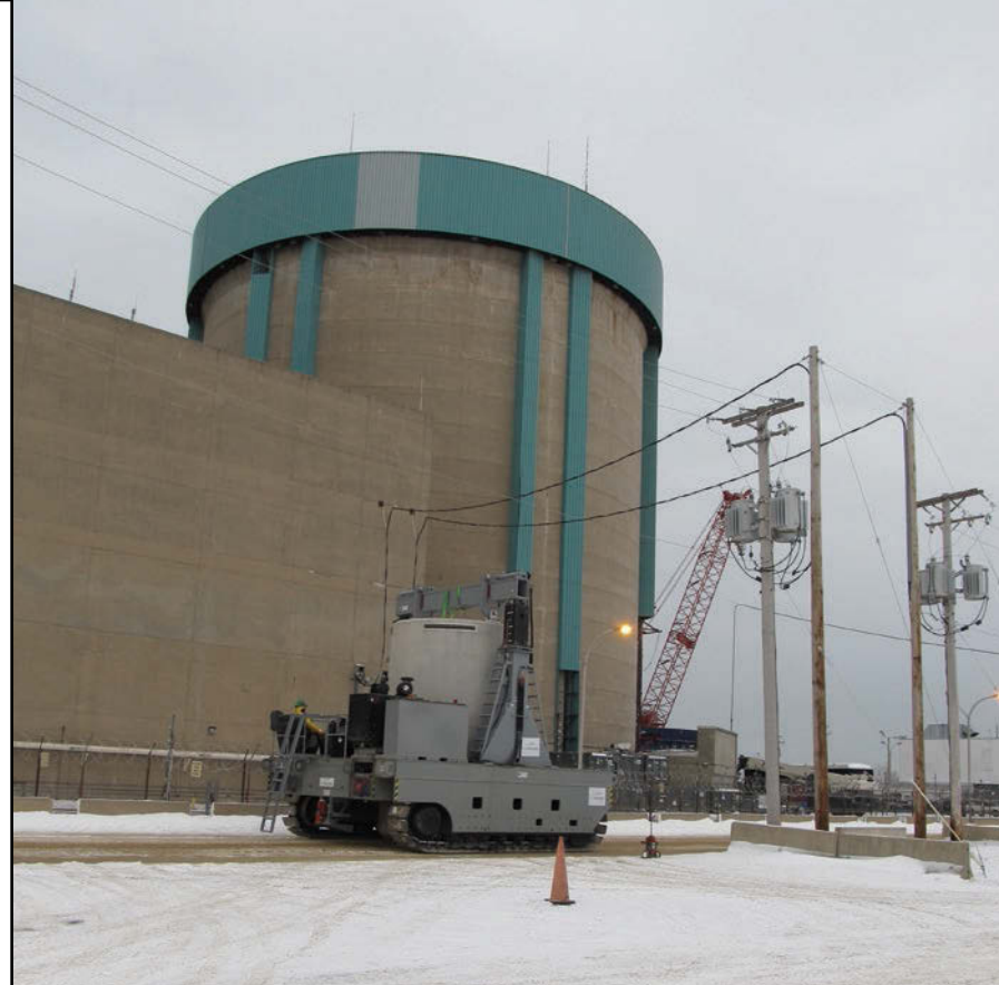
A cask is loaded onto a trackdriven cask transporter in preparation of transfer to the Zion ISFSI.

The cask transporter slowly makes its way to the ISFSI with the loaded cask. It takes about four hours for the cask to be moved to the ISFSI, located about 300 yards from the reactor building.