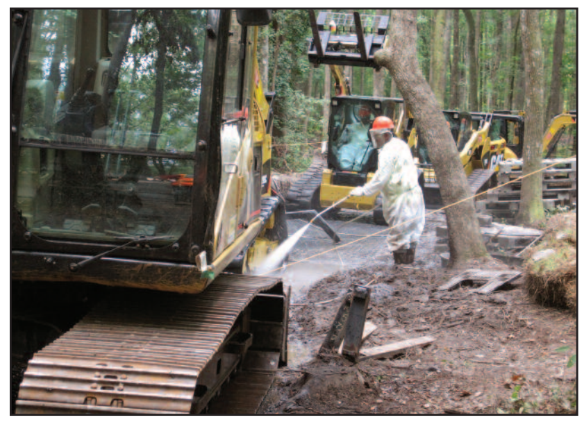
Power washers ensured the removal of any radioactive contamination clinging to heavy equipment used to remove soil near Lower Three Runs at SRS. The equipment was then radiologically surveyed to confirm acceptable release limits were met.

partment of Energy announced in June. Cocooning, a process being performed at most of the Hanford Site's production reactors, includes tearing down as much as possible of the reactor and its support structures and then sealing up what remains. The DOE has already cocooned six reactors at the site, and is starting work to cocoon the K East Reactor. That will leave only the K West Reactor, which will be cocooned after radioactive sludge is removed from water in its attached basin—work that started in mid-July. The ninth Hanford reactor, B Reactor, is being preserved as a museum. (For more on N Reactor, see "Cocooning Hanford's N Reactor—And Other River Corridor Closure Activities," this issue, p. 24.)