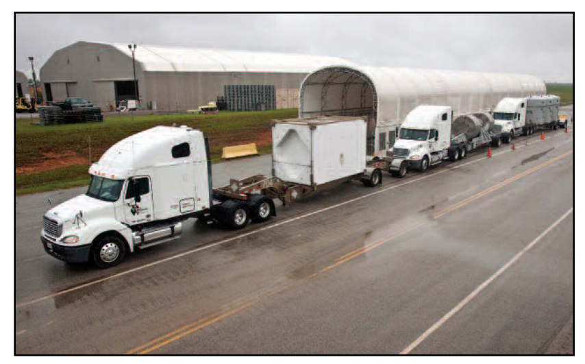
Three trucks, each bearing a different type of TRU waste container, get ready to leave the Savannah River Site, heading for the Waste Isolation Pilot Plant in New Mexico.

• Sellafield's Thorp reprocessing plant will stop reprocessing oxide fuel in 2018, the U.K.Nuclear Decommissioning Authority announced in early June, because all Magnox fuel will have been delivered to the site by a year prior to this date. Thorp was originally due to shut down in 2010, but a serious liquid leak in 2005 has extended clo-