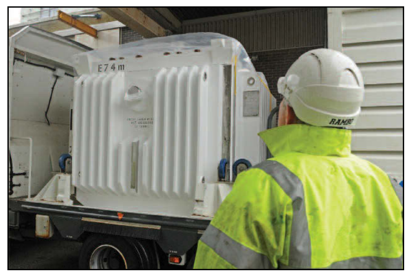
The final flask of fuel from the United Kingdom's Dungeness A nuclear power plant.