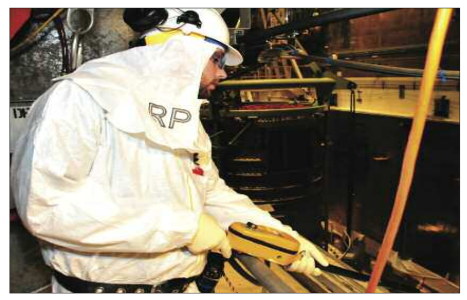
A survey with an extended teletector probe helps keep a radiation protection technician's dose as low as reasonably achievable.

engineering disciplines, Station Chemistry, Radiation Protection, Operations, and Maintenance. The group reviews operating limits and recommends changes if the fuel would be adversely affected. The team addresses all aspects of designing, fabricating, and transporting fuel, and of loading it into and unloading it from the reactor core; how the fuel is unloaded and reloaded several other times during the life of each fuel as-