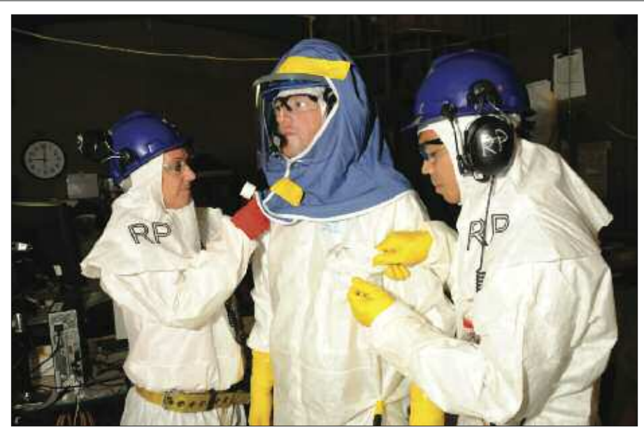
Members of the Radiation Protection team assist a worker in donning advanced protective clothing.

planned limits. Executive management demonstrates its seriousness about dose reduction by making these incentives available not just to APS employees but to supplemental employees as well.