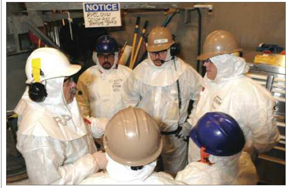
Radiation Protection conducts a two-minute drill to ensure that workers understand conditions prior to entering the work area.

Improved outage processes, planning, equipment, and tools all contributed to Palo Verde's lowestever personnel radiation dose achievement.