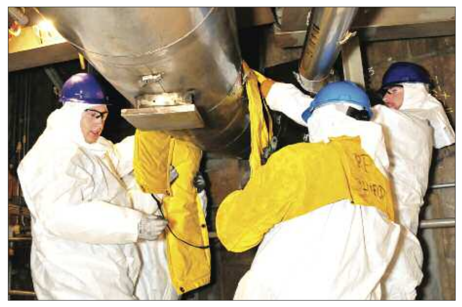
Workers install temporary shielding to lower radiation levels in the work area.

no primary-side steam generator inspection and maintenance activities were performed, allowing for a 7- to 10-rem exposure reduction.