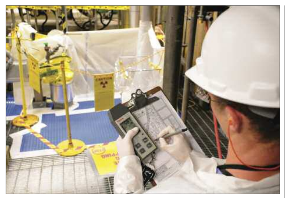
A radiation protection technician performs a routine radiation survey of work areas.

■ A modified upper guide structure and associated lift rig for the reactor core, replacing complicated original equipment used for positioning in-core mechanisms.