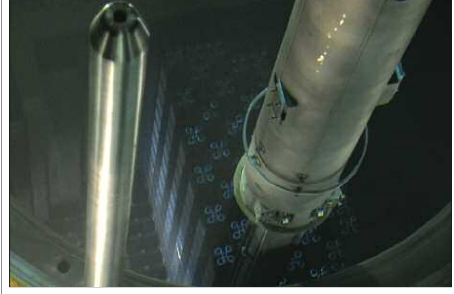
Nuclear fuel assemblies are removed from the reactor vessel during a refueling outage.

Palo Verde has also substituted materials in radiologically controlled areas with materials that are less prone to becoming ra-