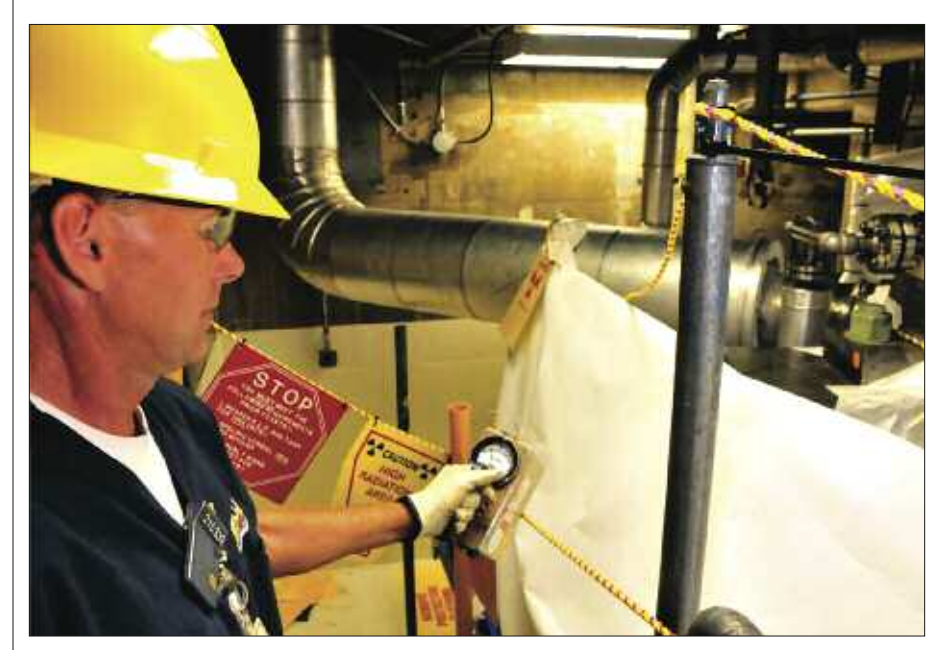
A radiation protection advisor takes a reading to ensure that a high radiation-area boundary meets regulatory requirements.

At Palo Verde, financial incentives are associated with achieving outage goals, and, in turn, a major component of outage goals is keeping radiation exposure within