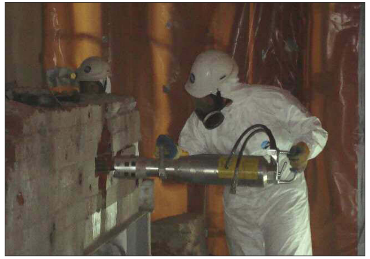
Coring and bursting operations of an "instrument bulge" (historically used to extract process liquor for analysis in the Primary Separation Plant) prior to removal from the facility.

Once used as a ventilation route, the High Active North Outer (HANO) cell is currently undergoing stabilization work to secure the steel internal beams, which have significantly corroded over time due to prolonged exposure to the acidic ventilation stream. This is being done by using a specially designed lightweight foam grout that Sellafield Ltd. developed in conjunction with the University of Dundee, Concrete Technology Unit, and Westlakes Engi-