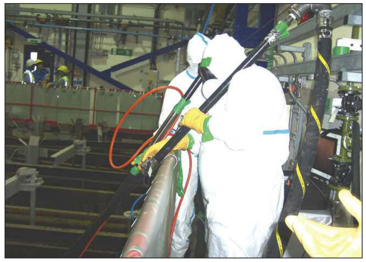
Desludging activities currently under way.

Radioactive sludge on the floor of the ponds poses a significant challenge to the decommissioning teams. Retrieval and packaging of this sludge is necessary to reduce the radioactive inventory in the buildings.