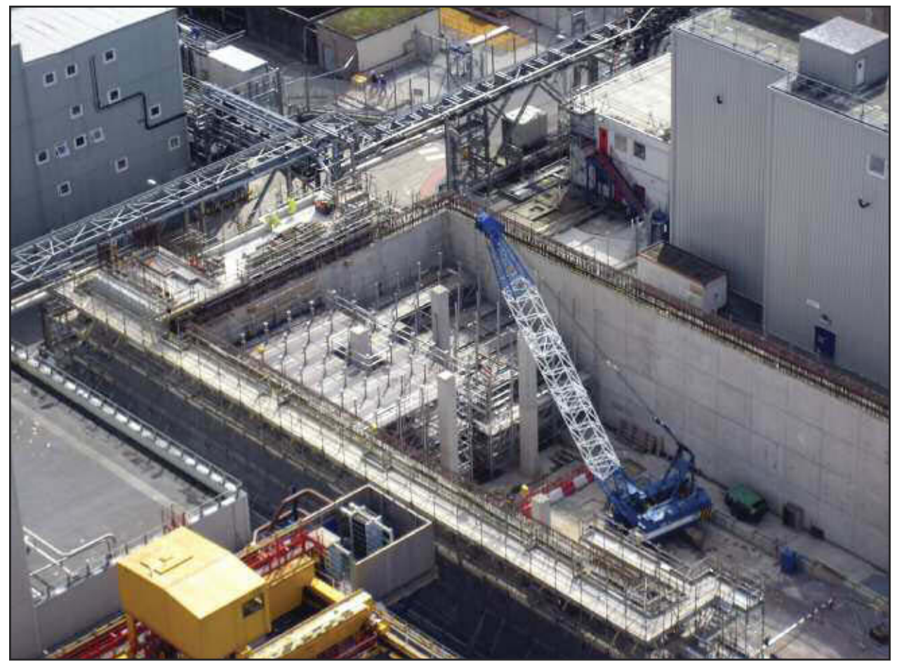
Progress as of mid-April 2010 on the Sludge Packaging Plant at Sellafield, which will receive legacy sludge from the First-Generation Magnox Fuel Storage Pond.