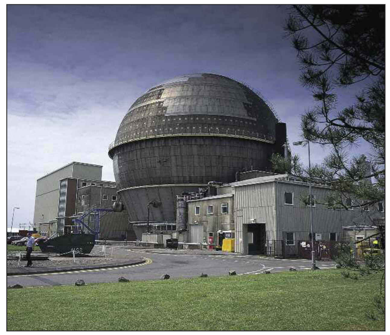
Built as a prototype, the WAGR facility was the forerunner to the 14 commercial AGR stations across the United Kingdom that followed.

Decommissioning operations on the golf ball-shaped Windscale Advanced Gas-Cooled Reactor (WAGR) probably the most iconic of the facilities on the Sellafield site—are also under way.