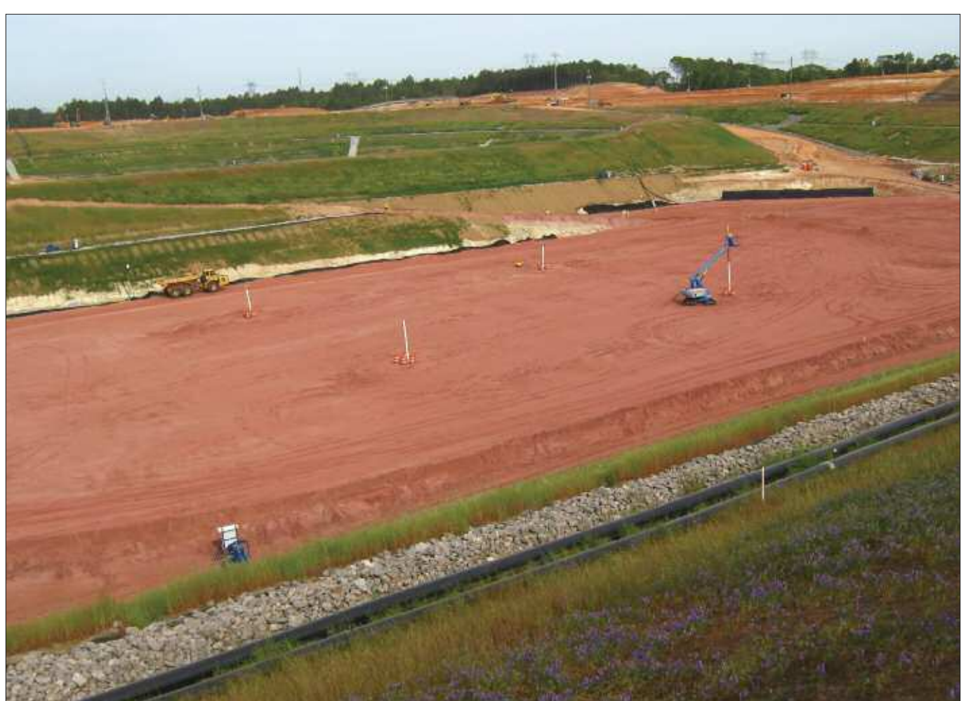
The Vogtle-3 excavation contained about 8 feet of backfill at the time of this photo (April 19). The slopes surrounding the excavation are terraced every 30 feet of height, with ramps to allow equipment to enter and leave.

The excavations are terraced every 30 feet of altitude, mainly for erosion control while the angled slopes remain exposed. A