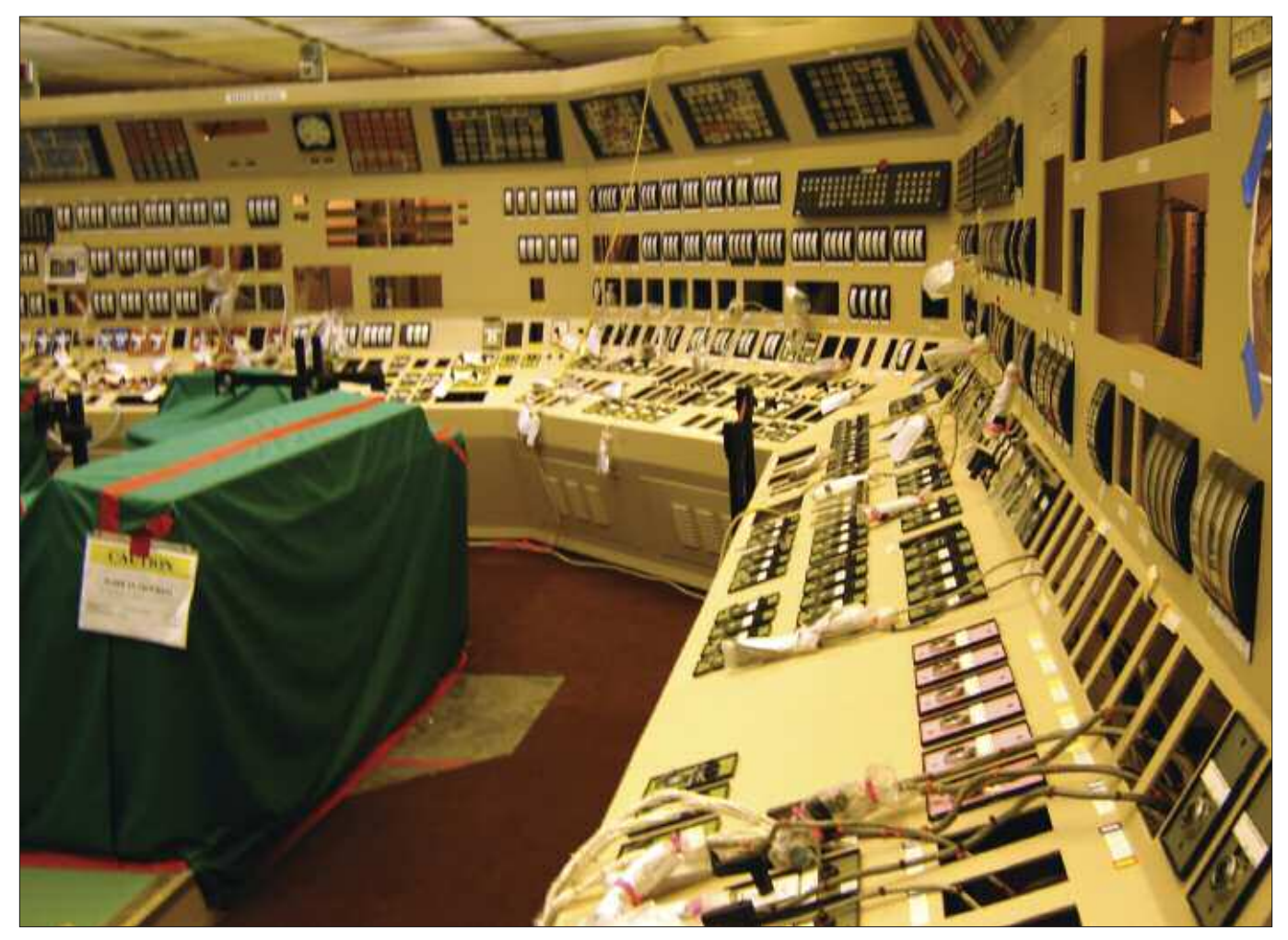
The Watts Bar-2 control room will maintain continuity with the controls and procedures in effect for Unit 1. It may have been possible to convert Unit 2 entirely to digital instrumentation and controls, but TVA prefers that Unit 2 be operable in the same way as Unit 1.

the footprint established for the reactor decades ago, which contributes to the air of intense activity. Not only is there a construction permit in effect, but much of the work is being done inside the existing structures of the containment building and turbine hall. Where either the replacement or in-place refurbishment of structures, systems, or components is taking place, the available space (especially in the already compact ice-condenser containment) is reduced even further by scaffolds and other temporary structures. Numerous tasks are going on at once, performed by teams led by the project's lead contractor, Bechtel. This is also the case in the turbine building, but it is less obvious because of the greater available space. (This reporter missed out by a few minutes on seeing and photographing a crane lift of one of the Unit 2 moisture separator reheaters. Win some, lose some.)