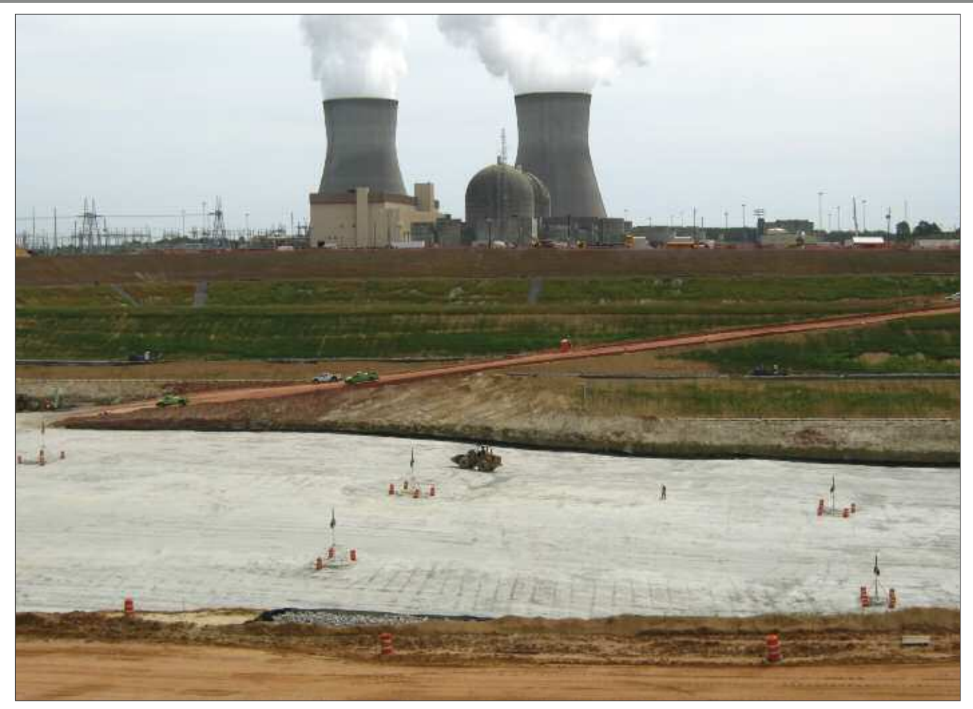
On April 19, backfilling had not yet begun for Vogtle-4. The structures on the blue bluff marl measure the vertical motion of the rock; with the 90-foot depth of dirt removed, the marl had risen measurably, and it was expected to lower again once the backfill was placed. Units I and 2, both in operation at the time, are in the background.

dewatering system draws water out of both excavations and into a retention pond, for later use in dust control. Reuse is practiced on much of the site; the concrete that was removed when old support buildings for Units 1 and 2 were cleared from the excavation zones will be crushed into aggregate for roadbeds, among other things.