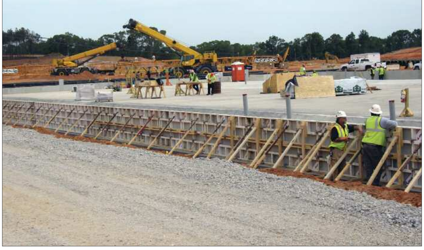
The foundation has been completed for the module assembly facility at Vogtle. Work on the building's other structures was just beginning.