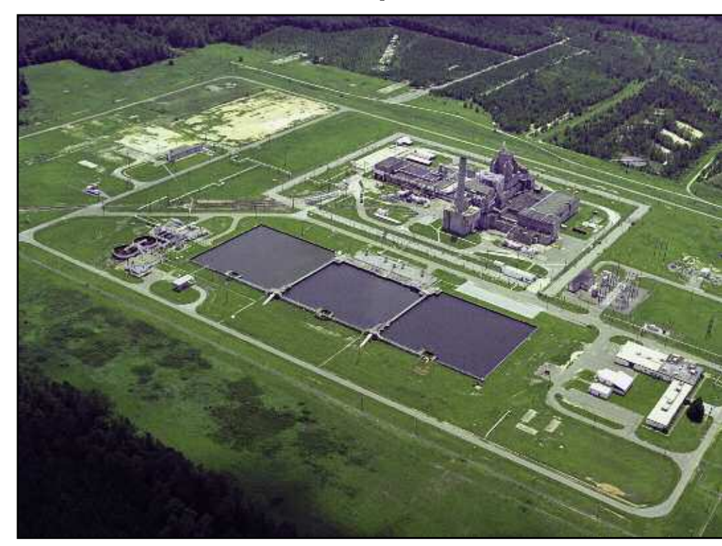
P Area as it looked in 2002, before deactivation and demolition work began in the area.

first area where we've actually attempted and completed an area-wide cold and dark," says Long. "Before this, we drew a box around a building and cut the power, water, and sources of hazardous energy into the building itself. In P Area, we drew that box at the perimeter fence, which was