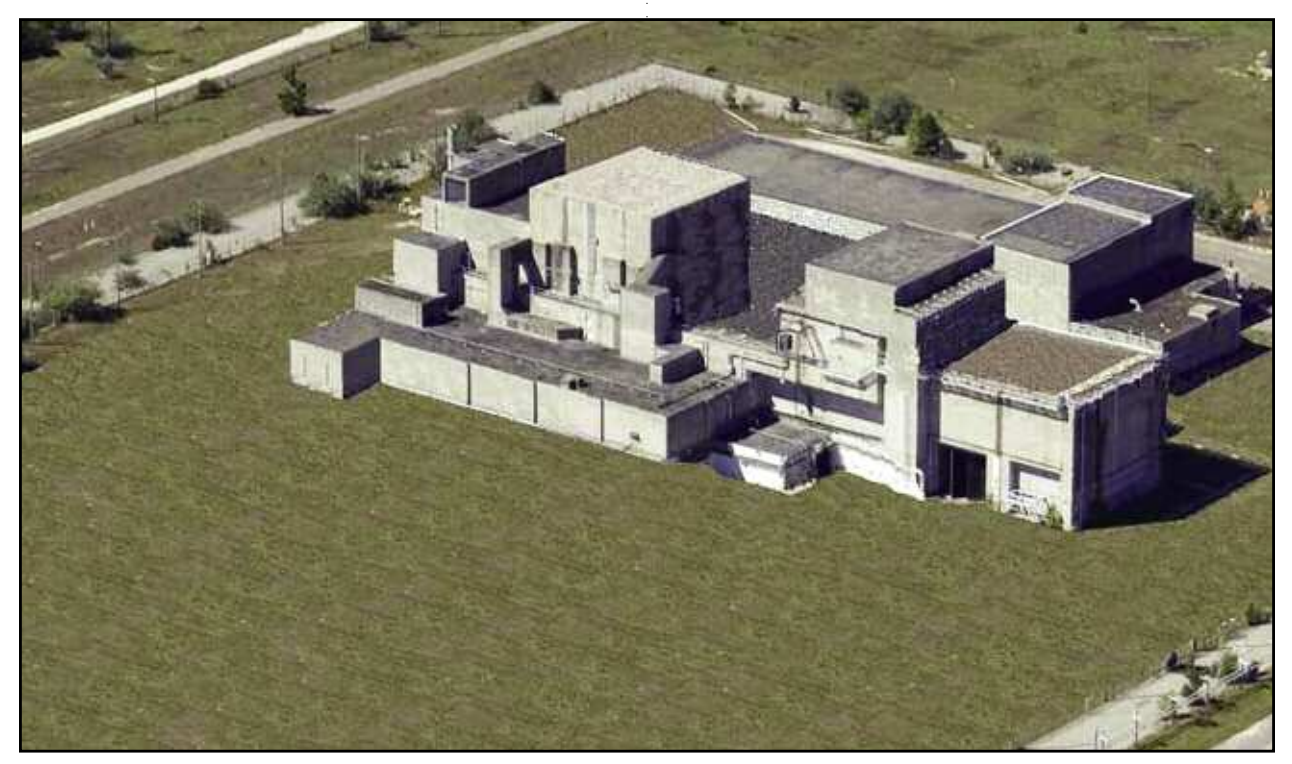
If the recommendation for in-situ P Area closure is approved through the regulatory process, the reactor building will look similar to this when work is completed.

While D&D crews are working on the reactor building itself, other remediation workers are cleaning up the soil and groundwater in P Area. Environmental restoration at SRS continues to be a challenging and dynamic process as new cleanup technologies and approaches are adopted for large industrial areas such as P Area with multiple contamination areas and types of contaminants. For all clean-