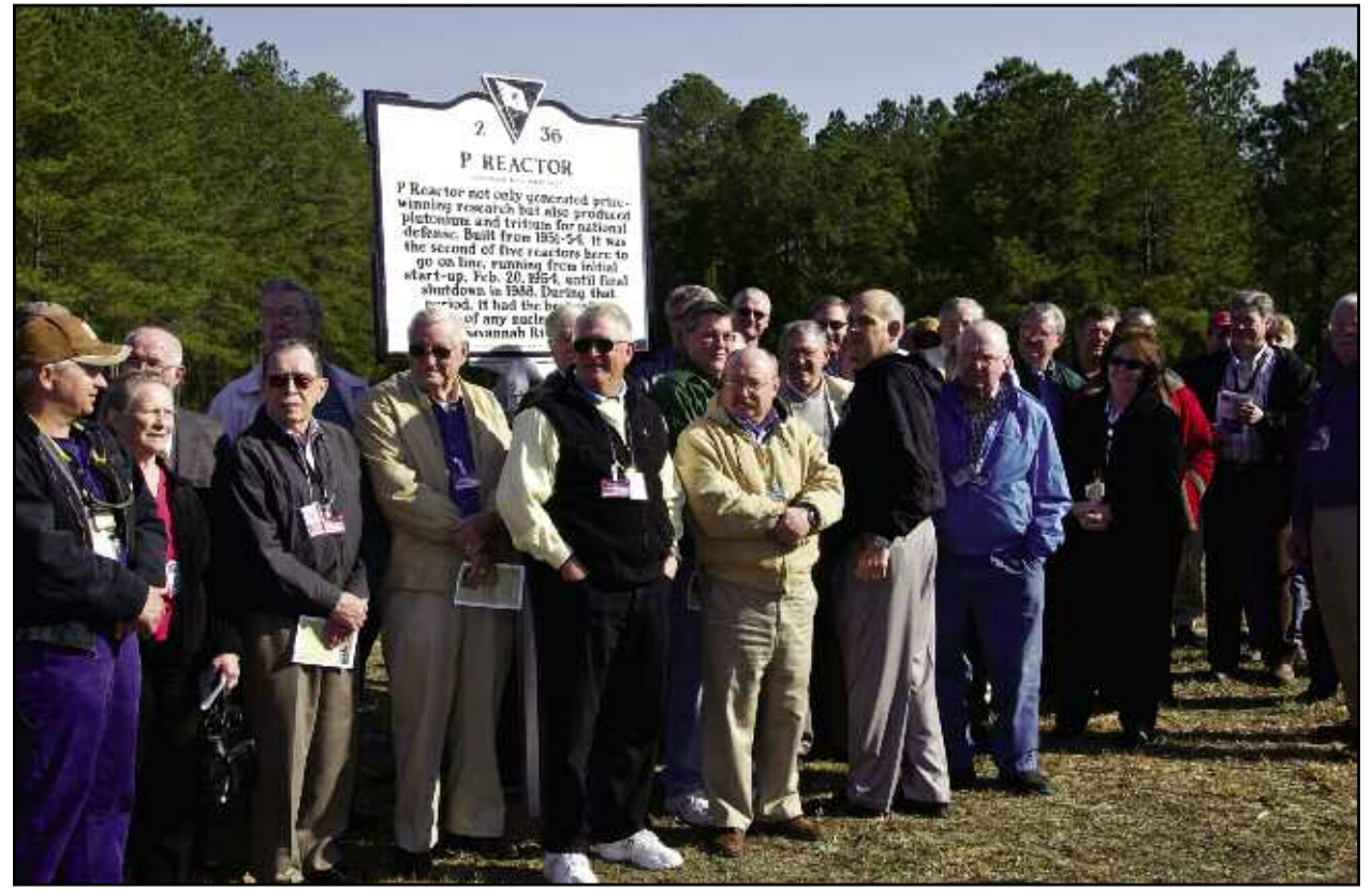
Former P Reactor employees were invited to participate in the unveiling of a state historical marker placed at the area entrance.