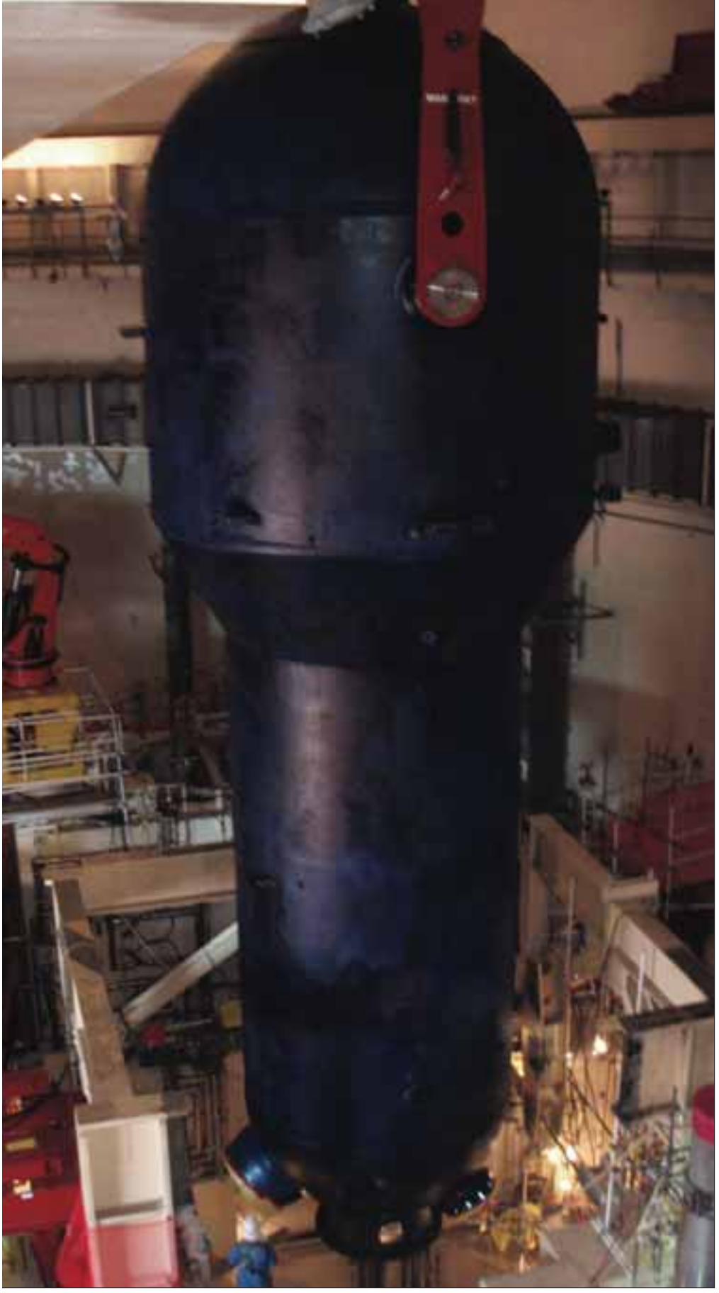
An original steam generator is removed from its cubicle inside the containment building. Both of the original steam generators were treated with a blue anticontamination coating prior to their removal. They were to be shipped to a disposal facility in Memphis, Tenn.

the containment sump, which is a system inside the containment building that is used to collect and filter spilled coolant for reuse in the event of an accident. Also accomplished was the replacement of one-third of the PWR's 217 fuel assemblies and other routine maintenance throughout the plant.