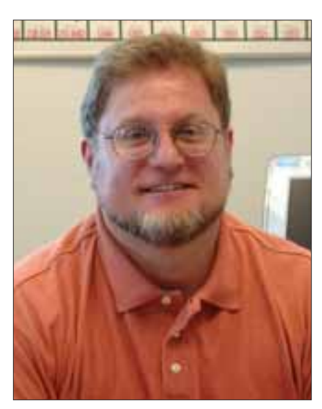
Conca: "WIPP is merely the best repository for anything that exists, including nuclear waste."

A science center in New Mexico that monitors radiation in the environment within a 100-mile radius of the WIPP repository has found no detrimental effects from WIPP's operation.