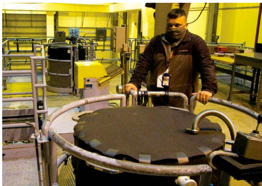
Top: The Centrus AC-100M centrifuge, sheathed in black protective covering, positioned in assembly stand, at the Piketon enrichment facility.