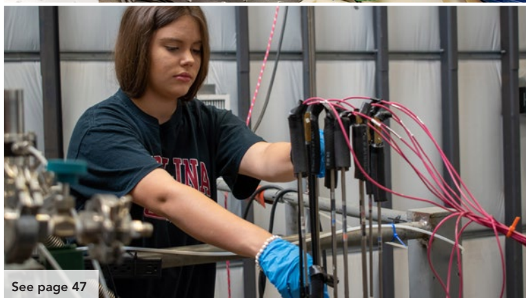
See page 47