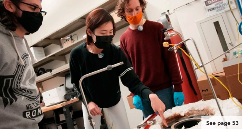
See page 53