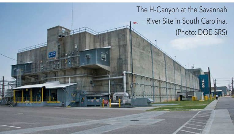
The H-Canyon at the Savannah River Site in South Carolina.

The HEU targets were irradiated for approximately seven days in the reactors and then dissolved in a nitric acid