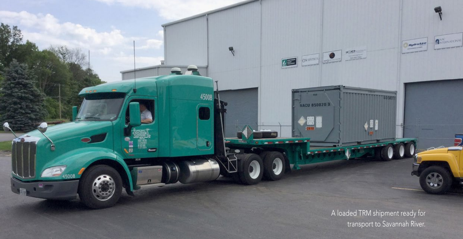
A loaded TRM shipment ready for transport to Savannah River.

responsibility for overall management of transportation in Canada and the United States.