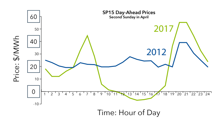
Fig. 1. Wholesale price of California electricity over a one-day period.

Higher-temperature heat opens up many heat markets, including industrial sectors that use large quantities of higher-temperature heat than can be provided by LWRs. The chemical industry alone requires about 100,000 MW of heat. The Next Generation Nuclear Plant program to develop high-temperature reactors was based on this market. That program was ultimately canceled because fracking dramatically reduced the cost of natural gas; the program was a victim of bad timing. However, the goal of a low-carbon economy makes nuclear energy competitive in that market if the reactor can provide high-temperature heat. There are also two newer and larger markets for high-temperature heat: variable electricity and hydrogen production.