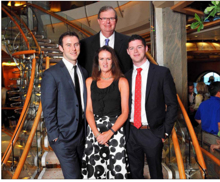
The Kray family on a cruise in 2015.