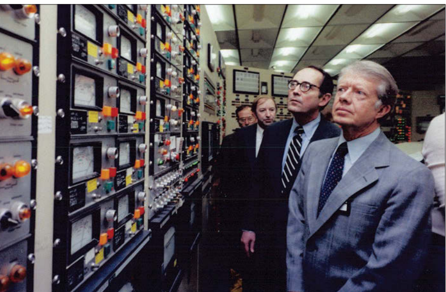
From right to left: President Jimmy Carter, Pennsylvania Gov. Richard Thornburgh, and the NRC's Harold Denton tour the TMI-2 control room on April 1, 1979.

ner. The PORV is a good example of such a component. During normal operation, the PORV maintains RCS pressure below specified limits by opening and closing and by discharging steam from the pressurizer. During abnormal events, as in the TMI-2 case, the PORV could be discharging twophase flow or water. The valve must be designed to perform its safety functionnamely, to close following a two-phase flow or water discharge. Apparently, this was not the case at TMI. The PORV was not designed to perform its safety function. The purchase order failed to specify this requirement, and the supplier of the valve did not know that the valve had a safety function and that it had to close following two-phase flow or water discharge.[2]