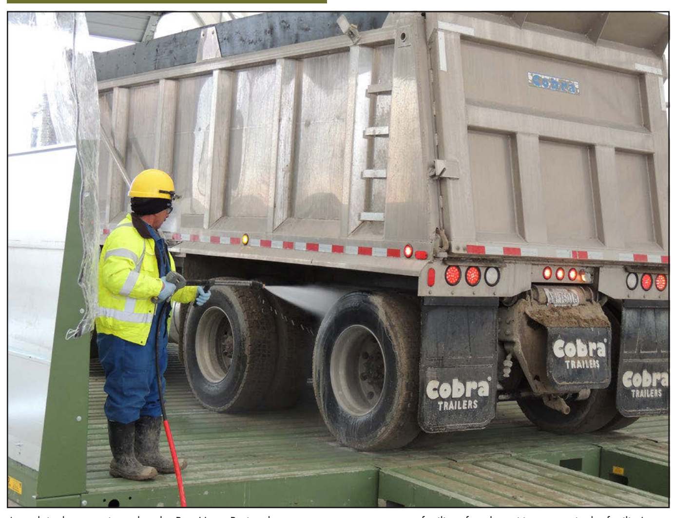
A truck is decontaminated at the Port Hope Project long-term waste management facility after depositing waste in the facility's baseliner storage cell.