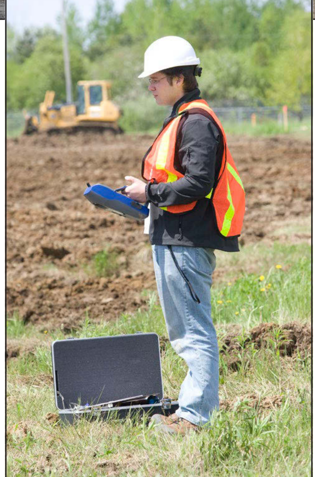
Dust monitoring is ongoing whenever PHAI construction is underway. The PHAI dust management plan sets out limits and action levels to ensure that dust is controlled and mitigated on-site for the protection of people and the environment.

low-level waste at homes and businesses within the community. To date, CNL has identified more than 800 properties that will require some amount of remediation. The cleanup of the first residential properties is scheduled to start later this summer.