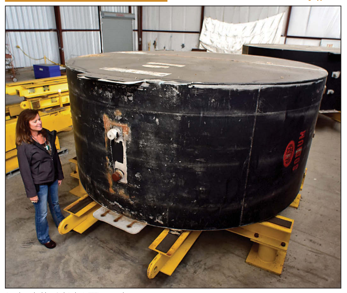
A sodium shield at Oak Ridge's ETTP awaits disposition.

but it is a small amount. Approximately 95 percent of the volume of cleanup waste on the Oak Ridge Reservation is stored on-site, while only about 5 percent has been disposed of off-site. At the same time, only about 15 percent of the radioactive curie content has been disposed of on-site, while 85 percent is being disposed of off-site.