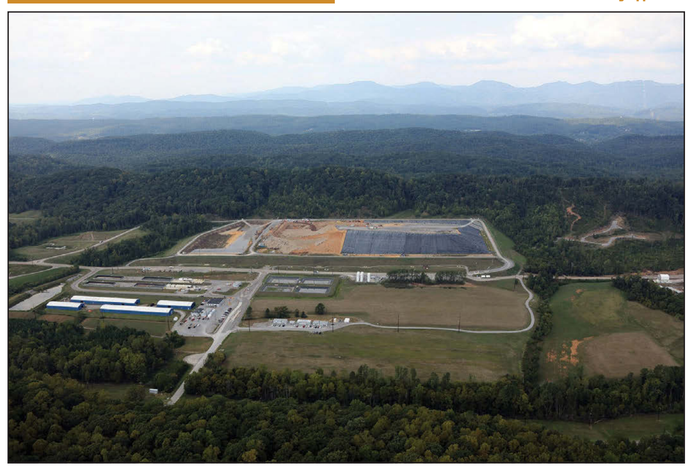
The on-site EMWMF waste facility is an above-grade waste disposal facility that is authorized to receive low-level radioactive and other regulated wastes from cleanup work associated with the Oak Ridge Reservation.