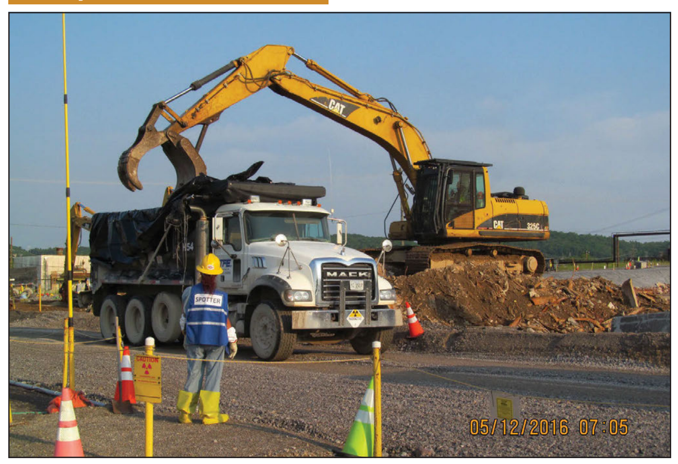
A truck is loaded with demolition debris for transfer to Oak Ridge's EMWMF.