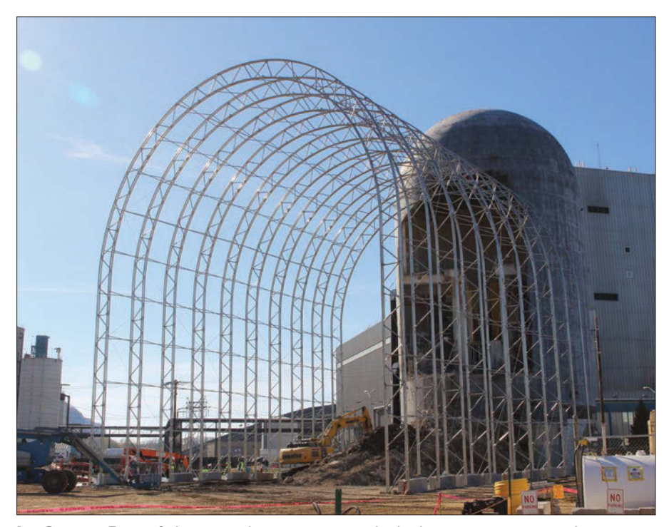
La Crosse: EnergySolutions is decommissioning the boiling water reactor under a license stewardship agreement with Dairyland Power.

I think the funding process is a good process. It is set up so that biennial decommissioning cost estimates [DCE] are done by independent groups, and utilities are required to either set aside or financially support those cost build-ups. There are very few large projects that are funded ahead of time, and you want those funds set aside because nobody can really predict the future.