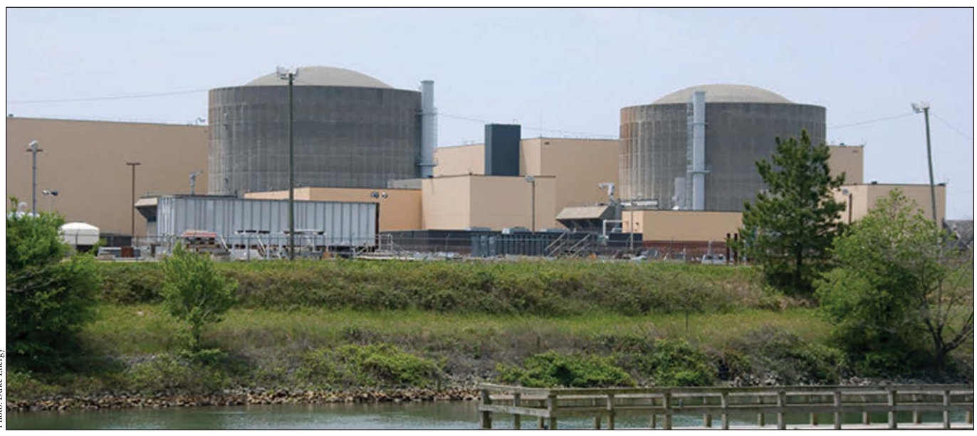
McGuire: The two-unit plant contributed over 22 percent of the nearly 90 billion kWh of electricity generated by Duke Energy's nuclear fleet in 2016.

zero emissions credits that would benefit FitzPatrick and other struggling upstate nuclear plants ( NN , Sept. 2016, p. 12). An application for the license transfer was jointly filed by the two companies on August 18.