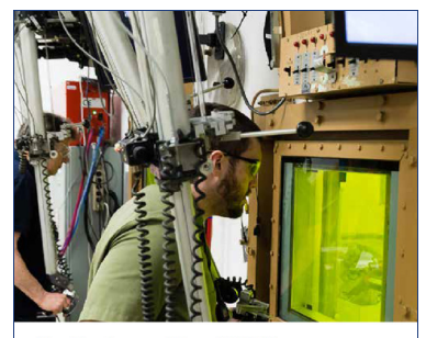
Westinghouse Churchill Site Pittsburgh, Pennsylvania