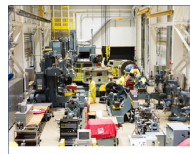
Westinghouse Waltz Mill facility Madison, Pennsylvania