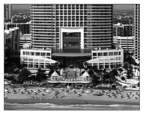
2011 ANS Annual Meeting • Hollywood, Florida

The opportunity to meet other professionals and discuss issues with recognized authorities will enrich your professional development.