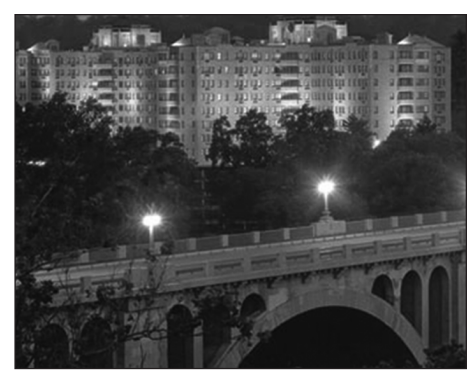
2011 ANS Winter Meeting • Washington, D.C.