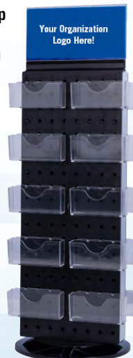
Tabletop Ribbon Station

Please contact us at conferences@ans.org to customize a package that will meet your needs.