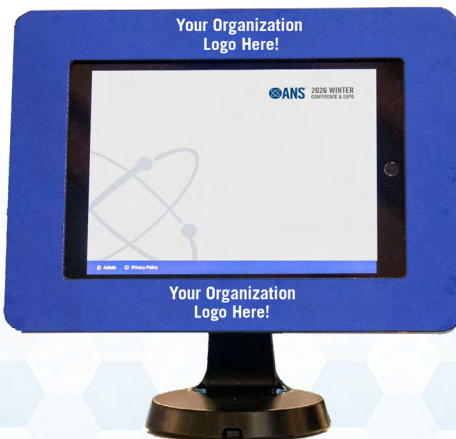
NEW! Registration Kiosk Wraps