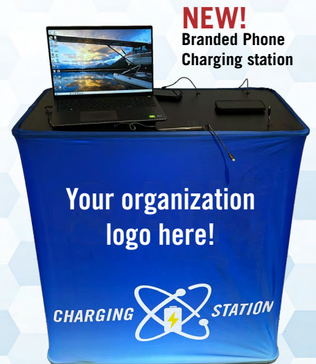
NEW! Branded Phone Charging station

* Images are examples only. Actual appearance will vary.