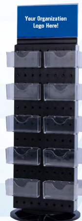
NEW! Tabletop Ribbon Station

* Images are examples only. Actual appearance will vary.