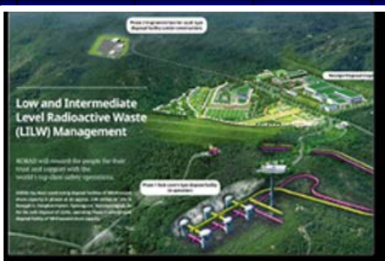
KORAD (Low- & Intermediate-Level Waste disposal)