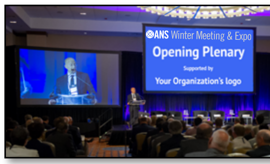
YOUR ORGANIZATION'S VIDEO AT START OF A PLENARY SESSION

YOUR COMPANY LOGO OR NAME RECOGNITION DISPLAYED BEFORE A VIRTUAL PLENARY