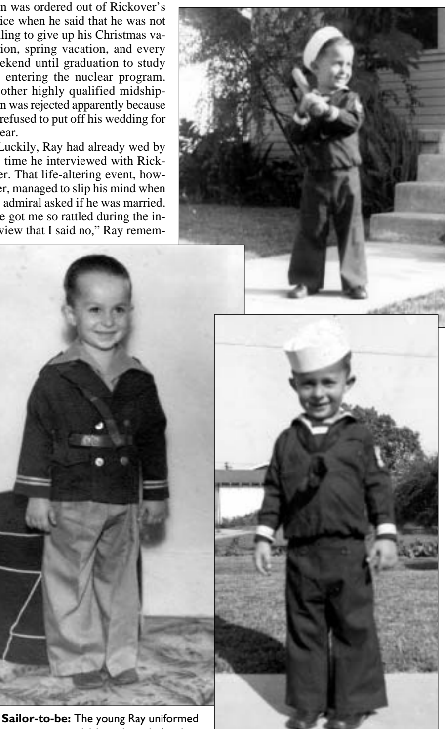
and (almost) ready for duty

Nuclear power had revolutionized the Navy. Following World War II, Rickover had convinced the service that nuclear sea power was feasible, and proceeded to direct the planning and construction of the world's first atomic-powered submarine, Nautilus, which was commissioned in