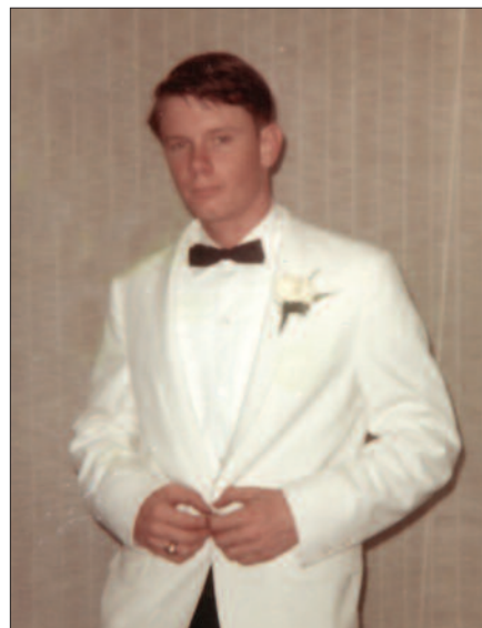
Best man in a wedding in 1967