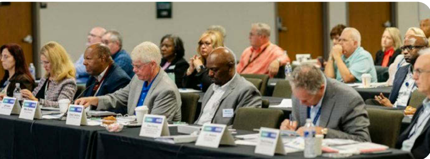
DOE and NNSA personnel at a meeting discussing the plans for the upcoming SRS landlord transition.

Details of the transition were discussed by DOE personnel during the SRS Landlord Transition Summit, held October 31–November 1, 2023, at the site. According to the DOE, the summit was designed to provide detailed briefings to the NNSA organizations that will be assuming the SRS landlord function, responsibilities, and interfaces on both an internal and external level, and to continue optimizing communications flow between DOE and NNSA personnel to accomplish a seamless site transition.