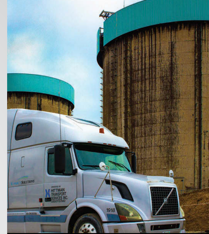
Zion D&D Project