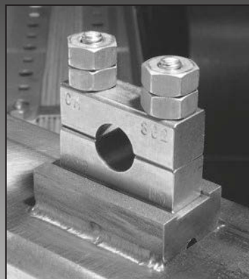
WELD-DOWN CLAMP BASE PATENT NO. US 9,670,949 B1

Q.A. PROGRAM: 10CFR50-B NQA-1 ASME III NCA-3800 CSA-N299.2