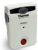
Thermo Scientific EPD Electronic Personal Dosimeter