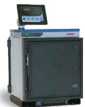
SAM12 Small Articles and Tools Monitor