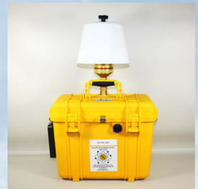
DF-40L-400 Emergency Response Air Sampler