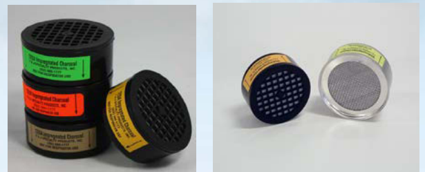
Radioiodine Collection Filter Cartridges