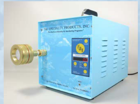
DF-EDL-1 Series ELITE DIGITAL LIGHT (EDL) Air Sampler