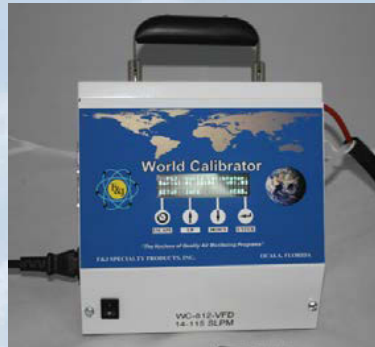
WC-VFD World Calibrator