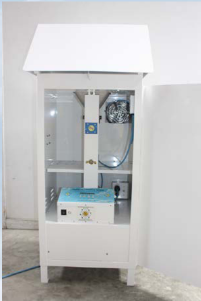
GAS-60810D Series Ambient Air Monitoring System