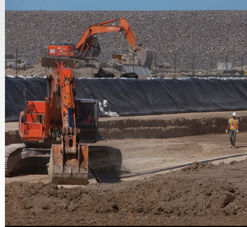
Clive Disposal Facility