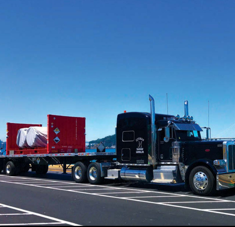
Transportation & Logistics