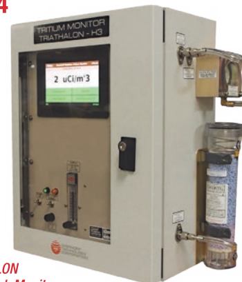
TRIATHALON Air & Stack Monitor