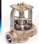
Camseal® Metal- Seated Ball Valves

Ask around and talk to peers! Thousands of high-performance Conval valves are operating in nuclear power plants around the world.