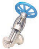
Bellows Seal Valves (high and low pressure)