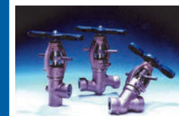
Clampseal® Globe and Check Valves