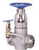
Swividisc® Gate Valves

Ask about our Certification, SEI-125, SEI-64, nuclear plant case studies and reference documents!