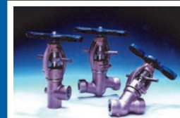
Clampseal® Globe and Check Valves