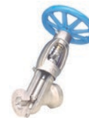
Bellows Seal Valves (high and low pressure)