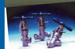
Globe, Gate, Metal-Seated Ball and Check Valves