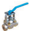
Camseal Ball Valves

Ask around and talk to peers! Thousands of high-performance Conval valves are operating in nuclear power plants around the world.