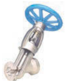
Bellows Seal Valves