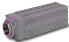
MegaRAD1 produce monochrome video up to 1 \times 10^6 rads total dose