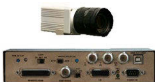
MegaRAD3 produce color or monochrome video up to 3 \times 10^6 rads total dose

With superior capabilities for operating in radiation environments, the MegaRAD cameras provide excellent image quality well beyond dose limitations of conventional cameras, and are well suited for radiation hardened imaging applications