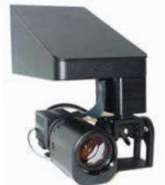
KiloRAD PTZ radiation resistant camera with Pan/Tilt/Zoom