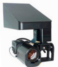
KiloRAD PTZ radiation resistant camera with Pan/Tilt/Zoom