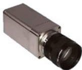
MegaRAD10 produce color or monochrome video up to 1 \times 10^7 rads total dose