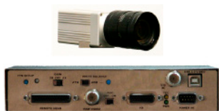
MegaRAD3 produce color or monochrome video up to 3 \times 10^6 rads total dose

With superior capabilities for operating in radiation environments, the MegaRAD cameras provide excellent image quality well beyond dose limitations of conventional cameras, and are well suited for radiation hardened imaging applications