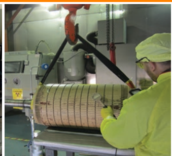
In-House Decon Facility