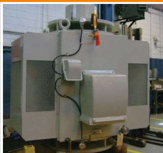
Safety-Related Motor Repair