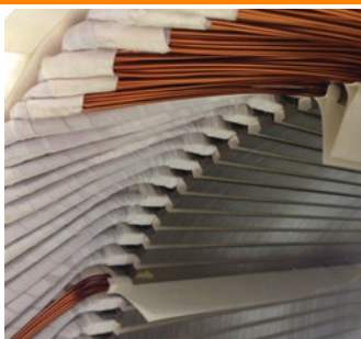
NUREG-0588 CAT-I (EQ) Insulation Systems