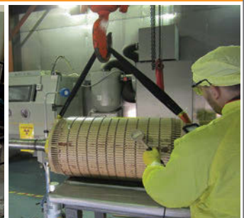
In-House Decon Facility