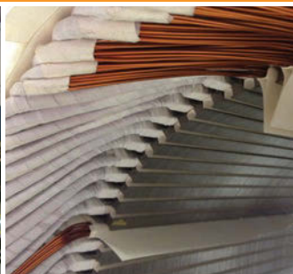
NUREG-0588 CAT-I (EQ) Insulation Systems