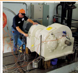
Gearbox Repair, Testing and Replacement