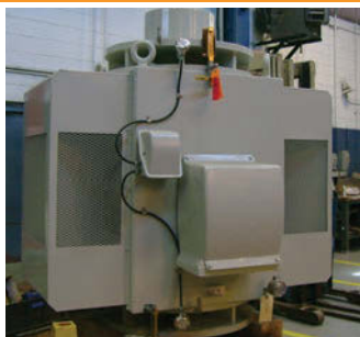
Safety-Related Motor Repair