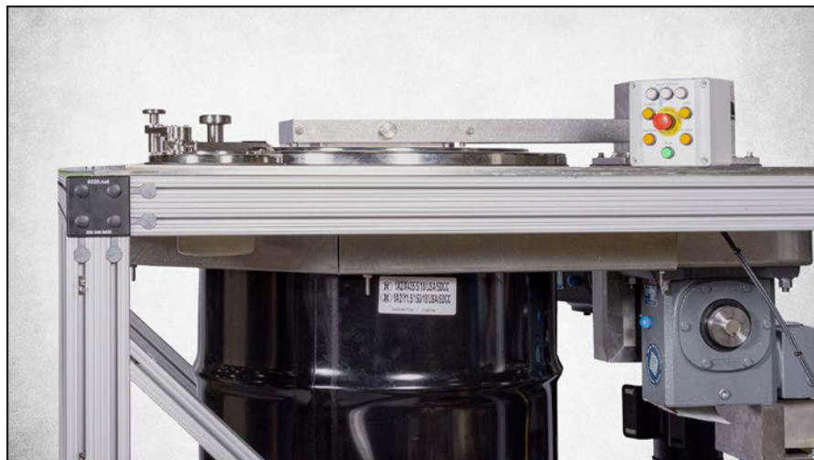
Electric motors raise and lower the drum, as well as rotate in and out of a locked position on the Alpha port.