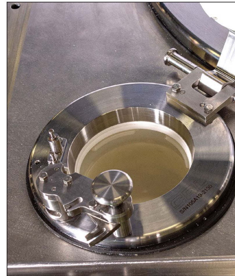
WDTS can also be customized to fit unique requirements. Shown on the left is an additional 105 Alpha port included with the system and various drum liner options on the right.

For more information, please visit crlsolutions.com/WDTS